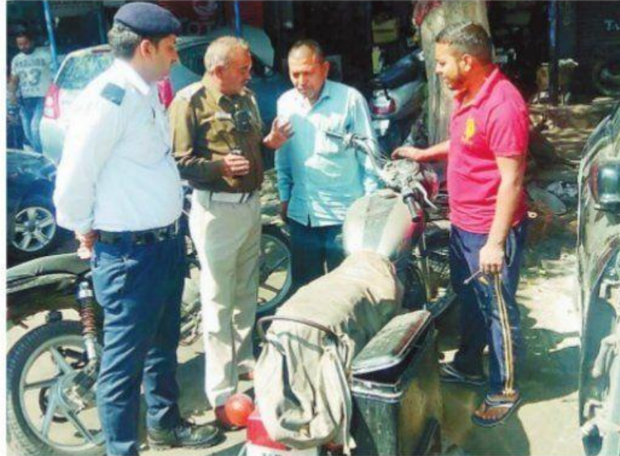
ट्रैफिक पुलिसकर्मी मार्कोट में मैकेनिकों को चेतावनी देते हुए।...